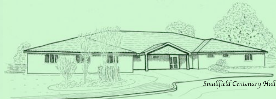
Smallfield Centenary Hall