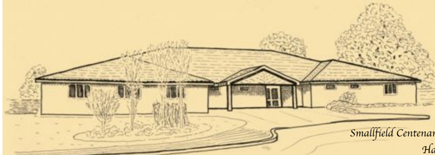
Smallfield Centenary Hall