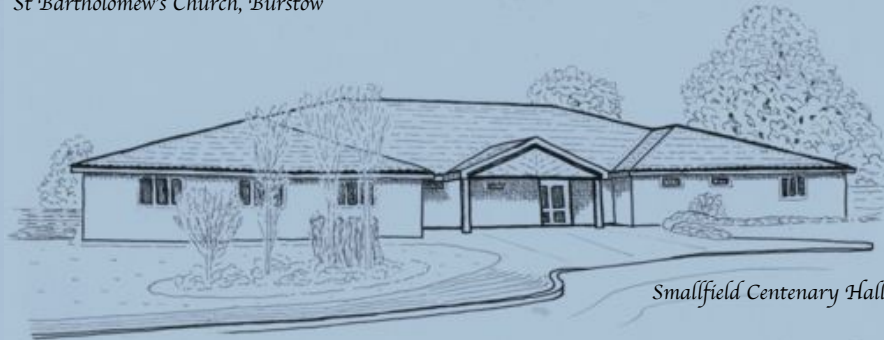
Smallfield Centenary Hall