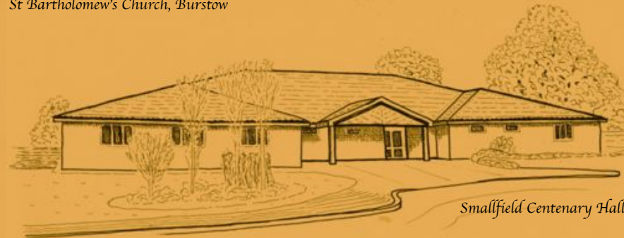
Smallfield Centenary Hall